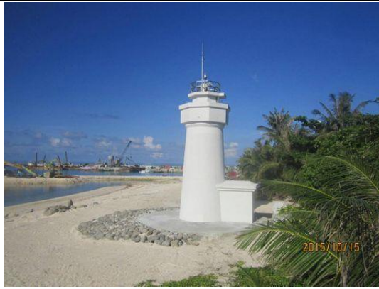
The newly built lighthouse on Taiping Island.

Washington, Dec. 18 (CNA) Six members in the U.S. House of Representatives recently expressed support for Taiwan's initiatives in the South China Sea, including its peace proposal and efforts to make Taiping Island a hub for humanitarian assistance and scientific research.