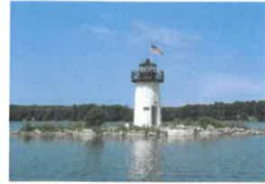
Ladies Delight Lighthouse