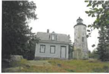
Baker Island Lighthouse