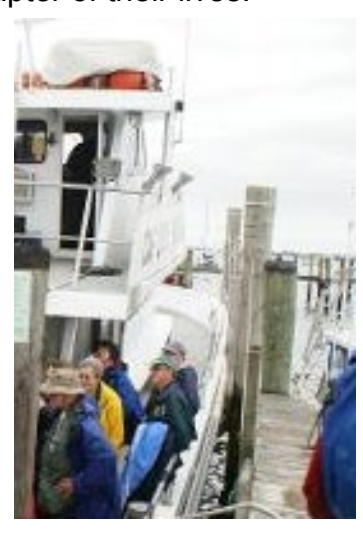
Getting off NELL Boat Trip June 2016