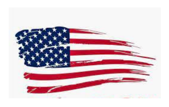
CELEBRATE FLAG DAY