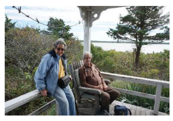
On porch at Sandy Neck 2018 Group photo