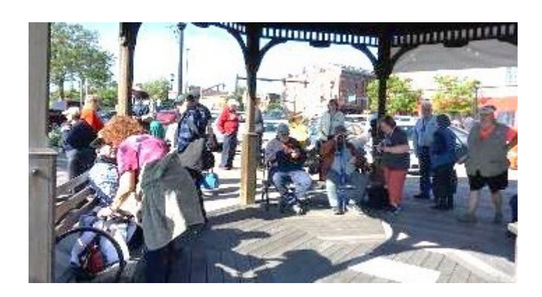
NELL group waiting for boat to lighthouses