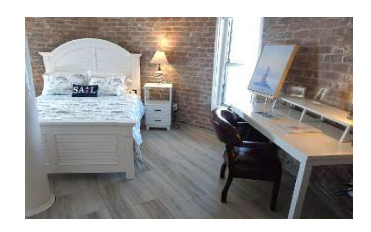
4 photos of rooms in Greens Ledge Light