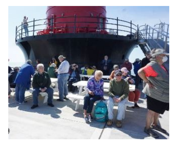
Group at Greens Ledge Light