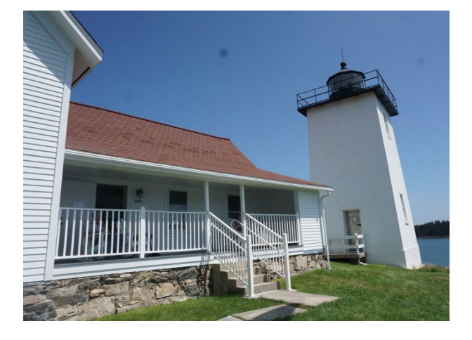
Visit to Dyce Head Lighthouse in Castine