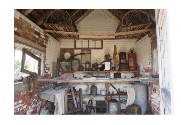
Another photo on inside of oil house A trip to Fort Point Lighthouse