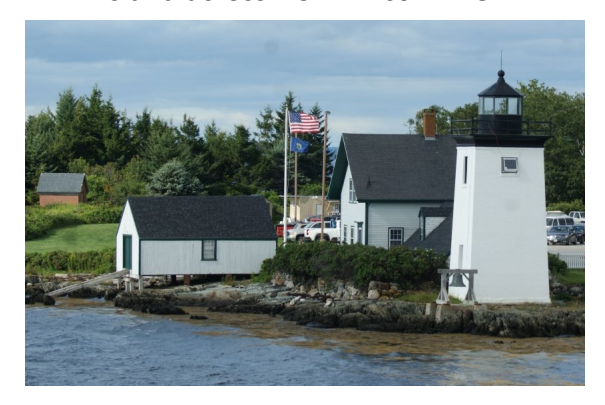
A visit to Swan Island to see & tour tower at Burnt Coat Harbor Lighthouse

Also visited while in Maine were Grindle Point Lighthouse on Islesboro Island across from Lincolnville