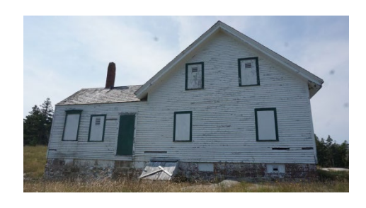
Left side of the Keeper's House

Also visited while in Maine were Grindle Point Lighthouse on Islesboro Island across from Lincolnville