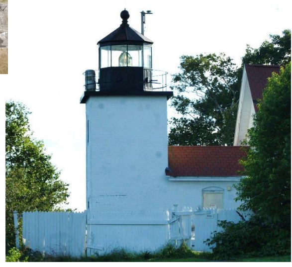
View of Prostpect Harbor Lighthouse