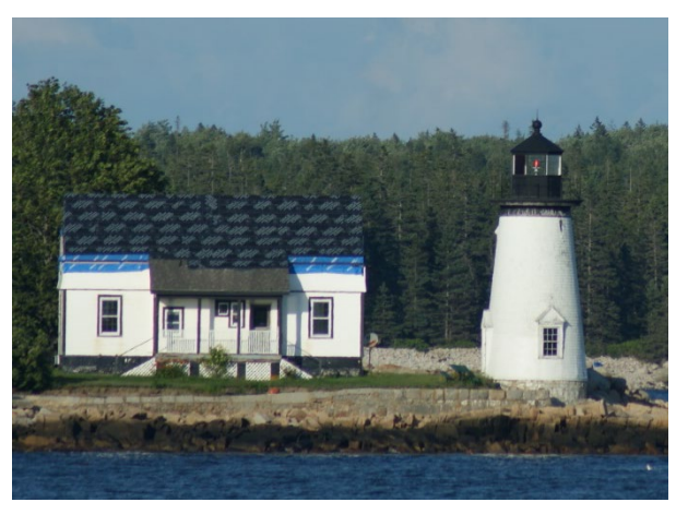
View of Pumpkin Island Lighthouse from Little Deer Island