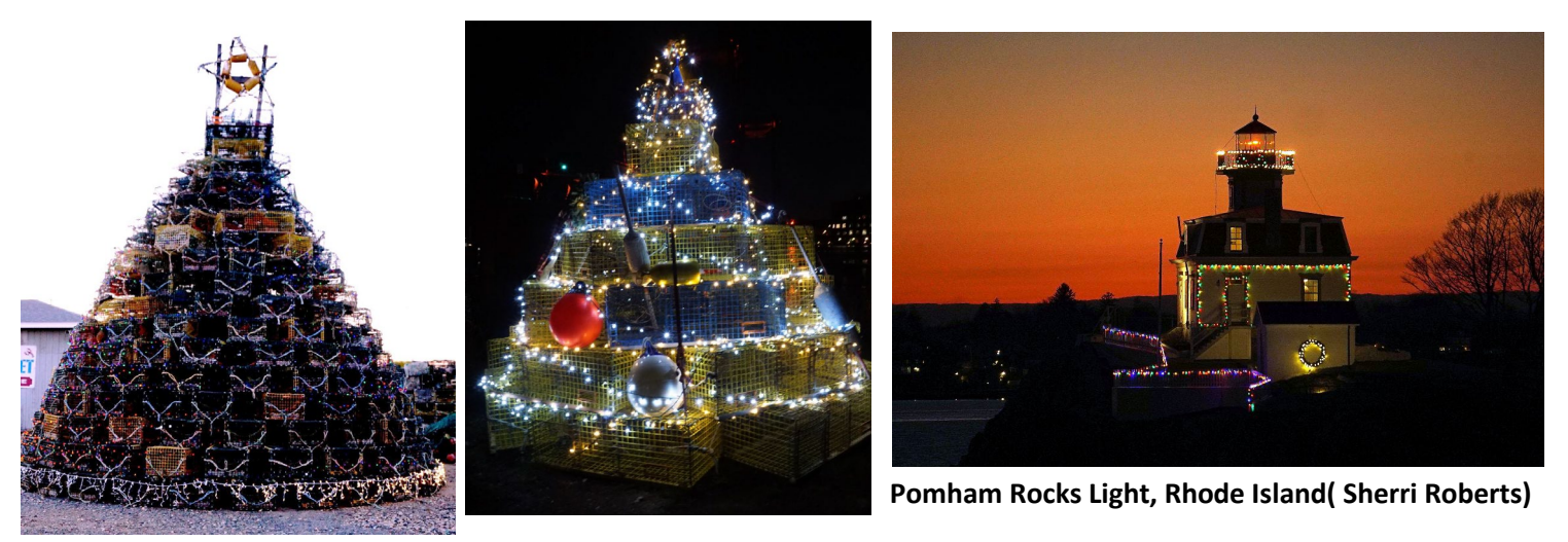
Lobster Pot Tree, Seabrook, NH – Lobster Pot Tree, Badger's Island Kittery, ME

Page 2 Lobster Pot/Buoy tree in Rockland, ME – Lobster Pot/Buoy tree between Rockland & W. Quoddy – Lit tree in window of W. Quoddy Keeper's House, ME – Mulholland Point Light, NB, Canada - * W. Quoddy Head Light, Lubec, ME (Didn't have big wreath up yet) – Owl's Head Light, ME – Marshall Point Light, Port Clyde, ME – Pg 3 Hendrick's Head Light near Boothbay Harbor ( no decoration) – Buoy Structure, ?? – * Pemaquid Point Light, Damariscotta, ME.