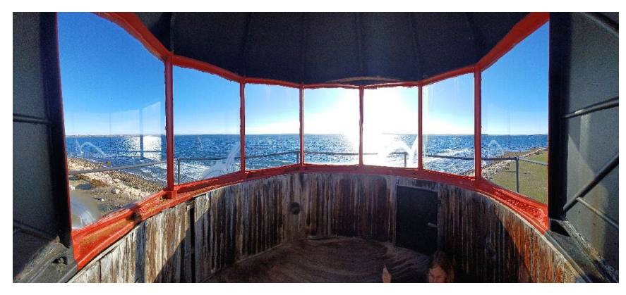
View from the Lantern Room