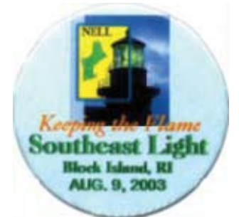
Summer 2003, Block Island, RI