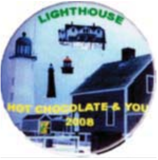
Winter 2008, Scituate, MA