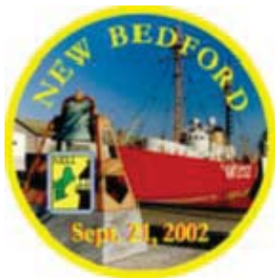
Fall 2002, New Bedford, MA