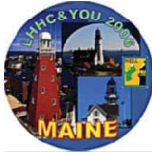
Winter 2006, Portland, ME