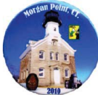
Winter 2009, Morgan Pt., CT