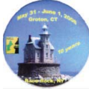
Spring 2008, Groton, CT