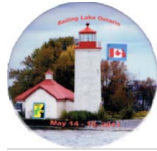
Spring 2011, Lake Ontario, ON