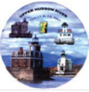
Fall 2007, Upper Hudson, NY