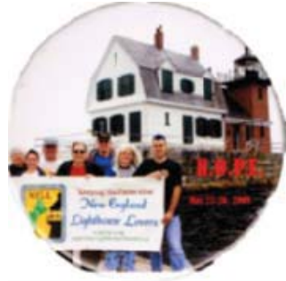
Spring 2009, Project HOPE, Rockland, ME