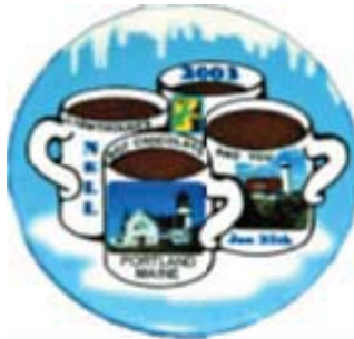
Winter 2003, Portland, ME