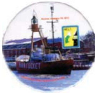
Winter 2011, Boston, MA