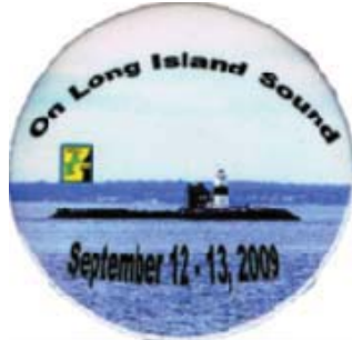
Fall 2009, Long Island Sound