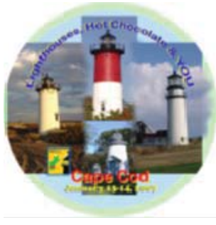
Winter 2007, Cape Cod, MA