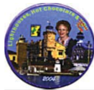
Winter 2004, Eastern CT