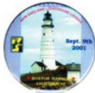
Fall 2001, Boston Harbor, MA