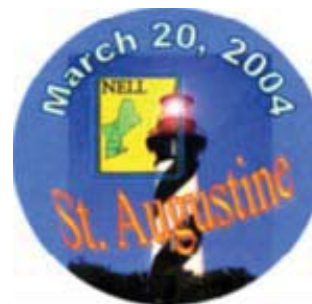
Spring 2004, St. Augustine, FL