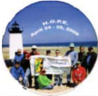
Spring 2009, Project HOPE, Cape Cod