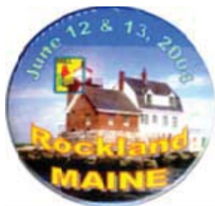
Summer 2004, Rockland, ME