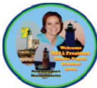
Fall 2004, Newburyport, MA