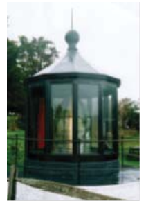
Great Point Light 3rd order lens

The lens outside the station is the old 3rd order Fresnel lens from the Great Point Light that fell into the sea but was rescued and put on display there.