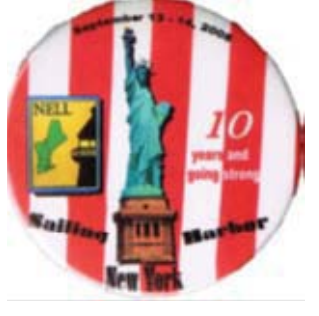
Fall 2008, New York Harbor