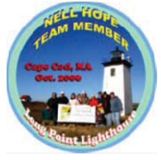
Fall 2006, Project HOPE