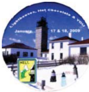
Winter 2009, Newport, RI