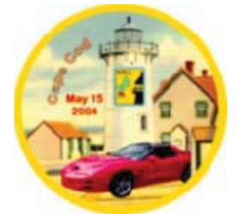
Spring 2004, Cape Cod, MA