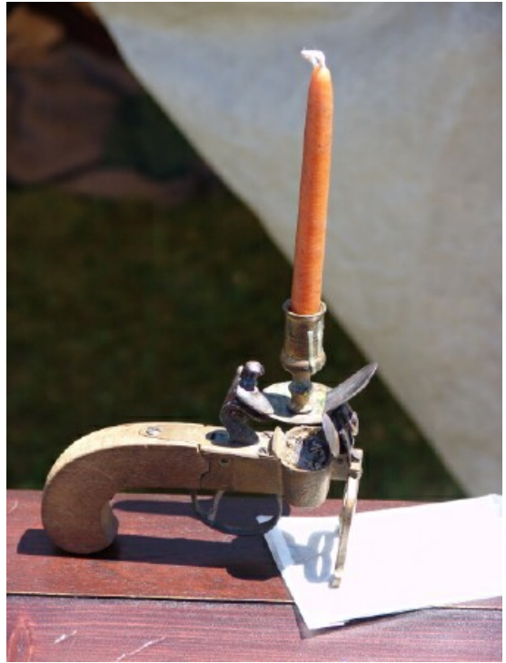
Early candle lighter