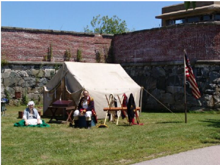
British encampment at Fort Constitution