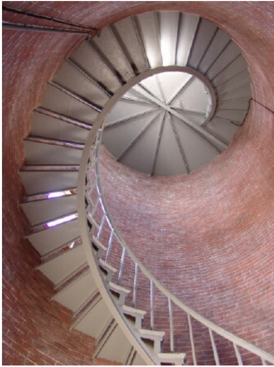
Interior staircase and brick Portsmouth Harbor Light