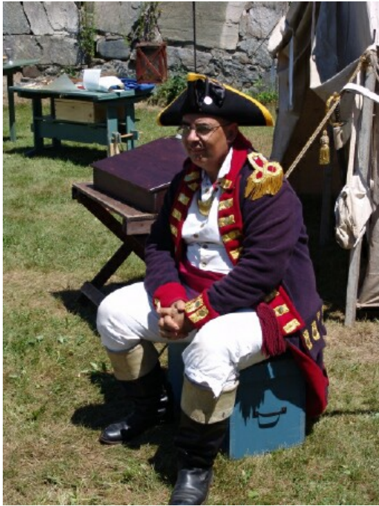
British soldier of the American Revolutionary