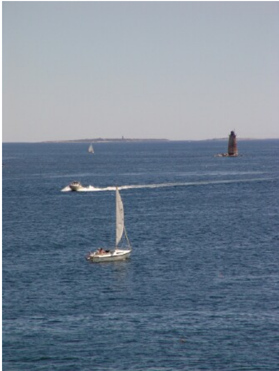
A beautiful day to sail past Whaleback Lighthouse