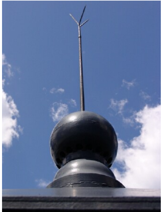
Ventilator ball and lightning rod on Portsmouth Harbor Light