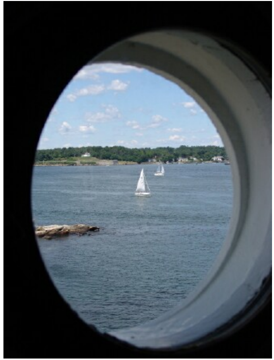
View from inside Portsmouth Harbor Light