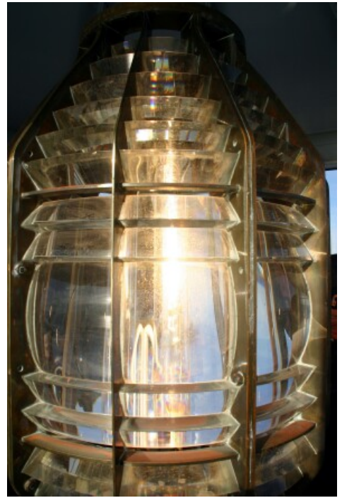
Pt. Judith 4th Order Lens