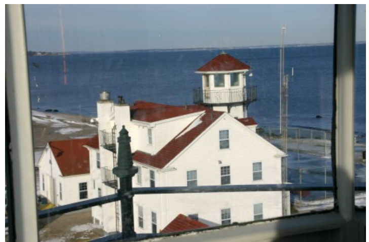
Coast Guard Station Pt. Judith from lantern room