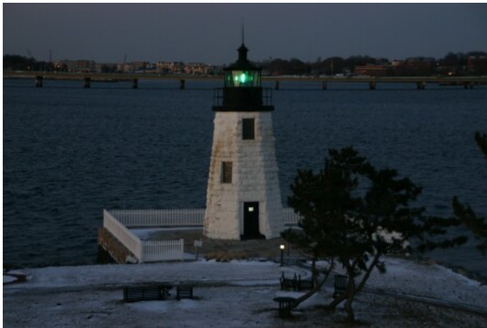
Goat Island at dusk