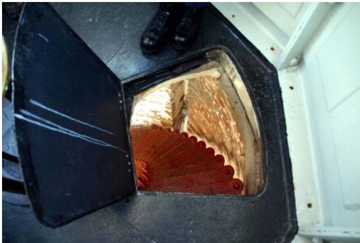
Entrance to Pt. Judith Lantern Room