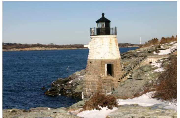
Castle Hill full view