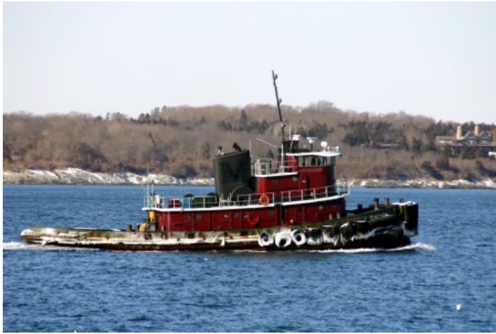
Tug passing Castle Hill Light