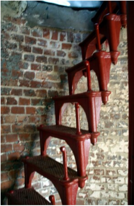
Stairway to Pt. Judith lantern room