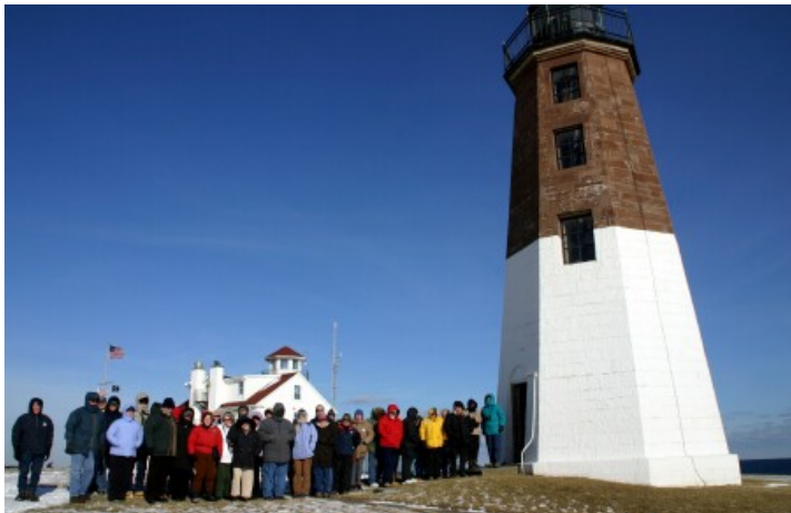
Waiting to climb Pt. Judith