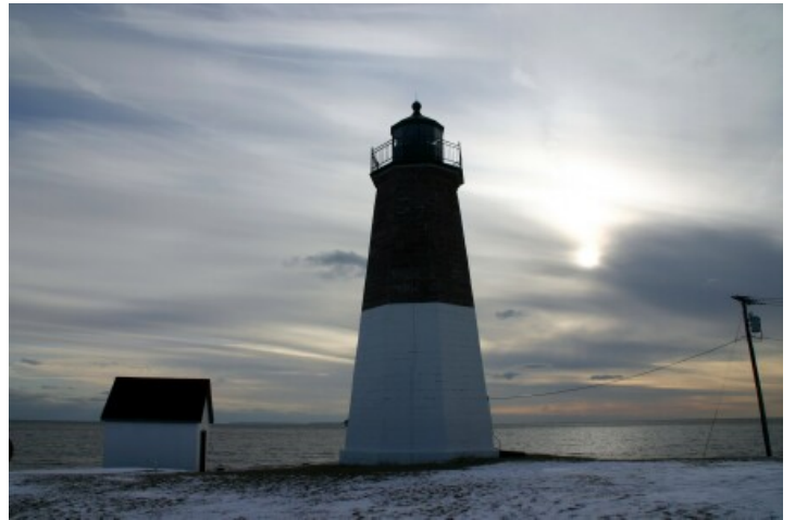
Pt. Judith Light