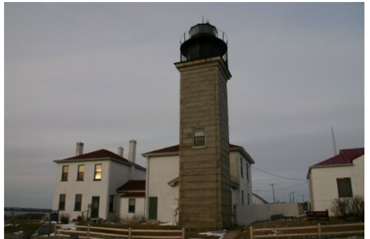
Beavertail Light and Museum - Gift Shop