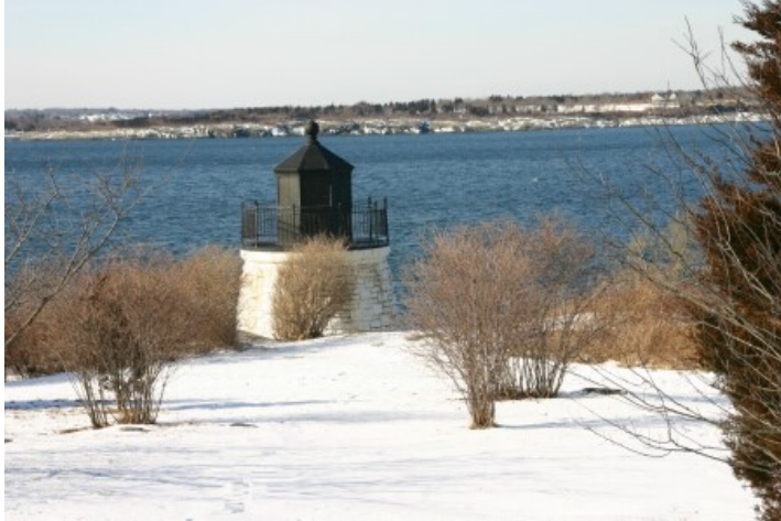
Castle Hill on Narragansett Bay