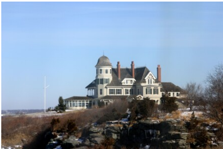
Castle Hill Inn & Resort from Lantern Room