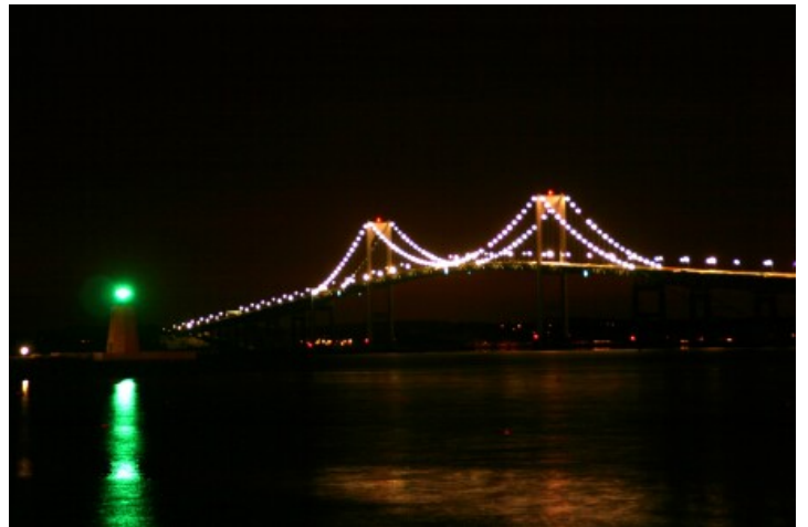
Goat Island and Newport-Pell Bridge