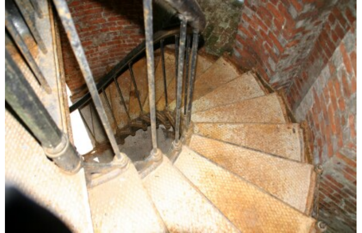
Castle Hill staircase from Lantern Room