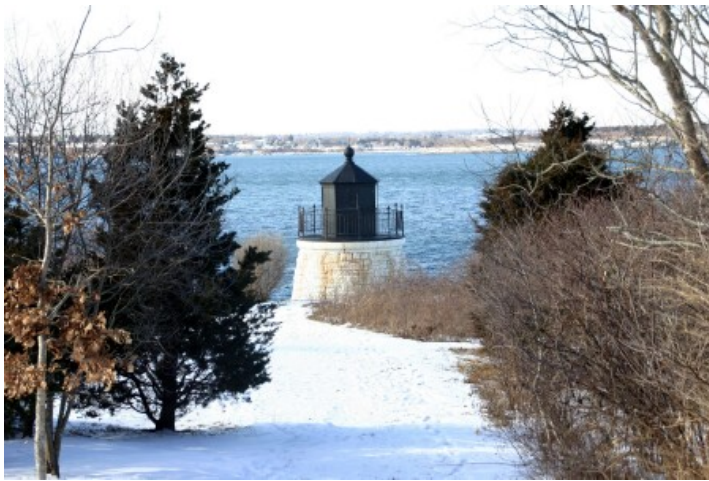
Castle Hill view from the woods