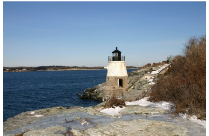
Full view of Castle Hill Light