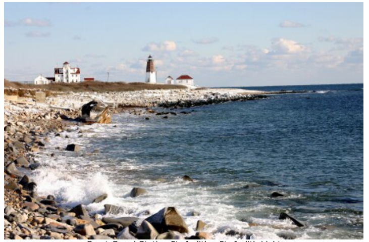
Coast Guard Station Pt. Judith - Pt. Judith Light