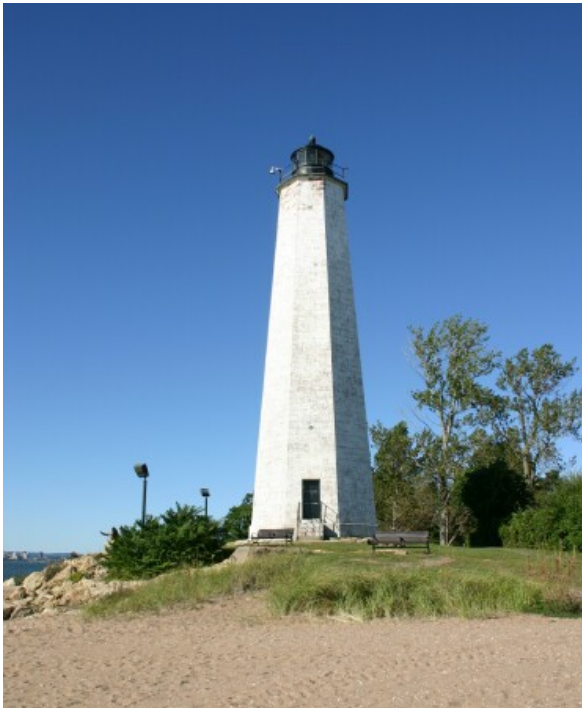
Five Mile Point Light