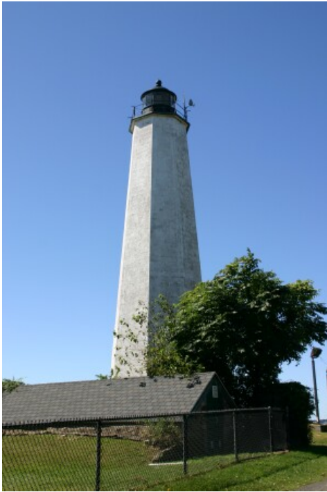
Five Mile Point Light