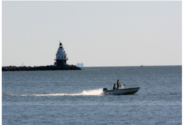
Southwest Ledge Light