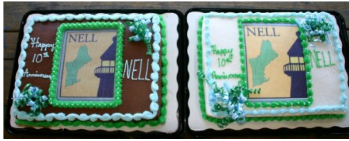
Nell Anniversary Cakes