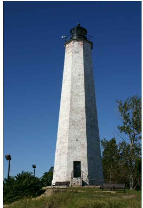
Five Mile Point Light