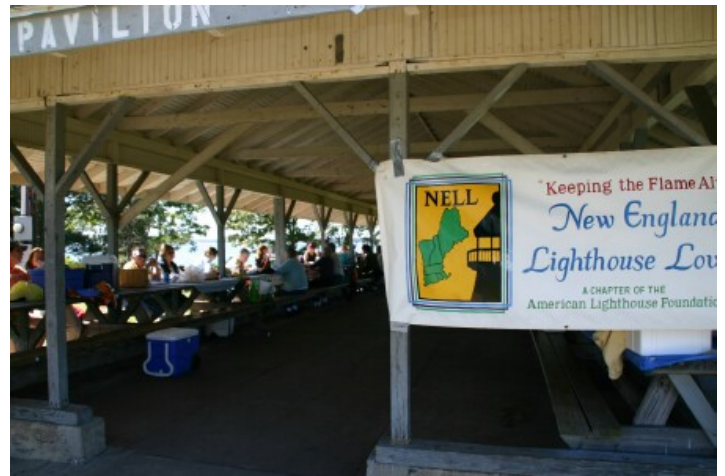
Our NELL Banner