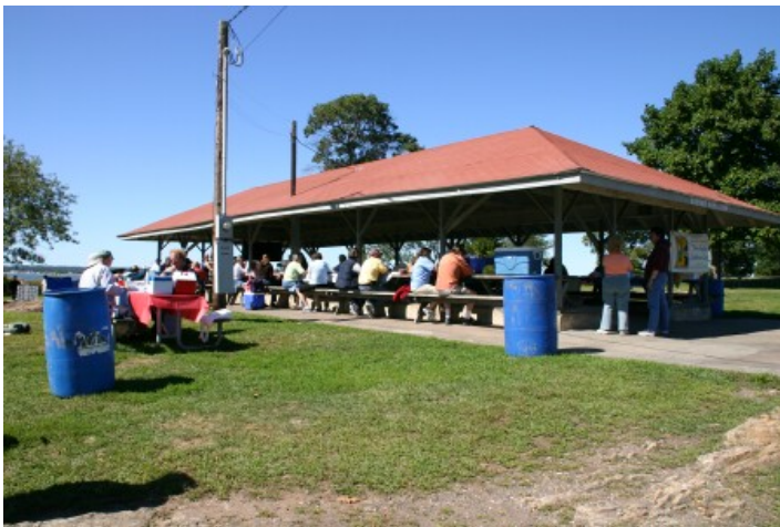
Pavilion where the 10th Anniversary Picnic was held