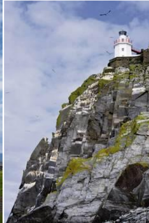
Bull Rock Lighthouse

The Irish Landmark Trust, together with the Commissioners of Irish Lights, has recently launched the All-Island Lighthouse trail, and work is currently underway to open all the lighthouses around the country to the public. At present, there are four lighthouses with accommodation – offering visitors the unique opportunity to be 'keepers of the light' – while another three are open for informative tours and exhibits. There are six more in the development phase and the remaining properties are awaiting the final go-ahead.