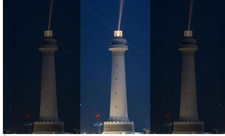
The Oct. 9, 2015 photo released by China's Xinhua News Agency shows a lighthouse in the disputed South China Sea.

Vietnam on Wednesday 14th October 2015 slammed China over its construction of two lighthouses in the disputed South China Sea, saying the move violates Vietnam's sovereignty and escalates tensions.