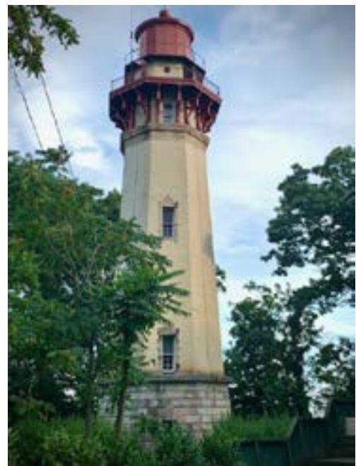
Staten Island Lighthouse

If any other members did something of interest this past National Lighthouse Day, please send a paragraph or two about what you did and photos to the Editor at SMills8839@aol.com and I'll be glad to include them in the next NELL NEWS.