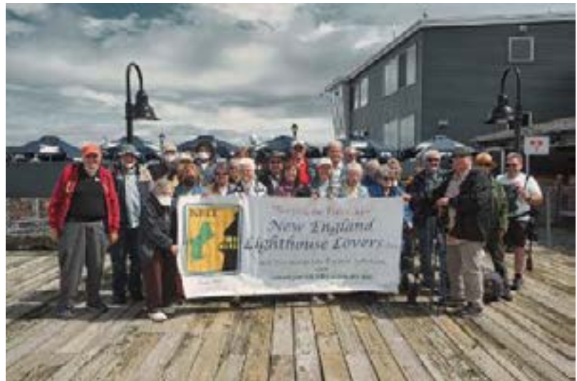
Group Photo after Saturday Boat Trip