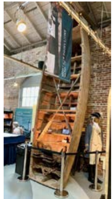
Rescue Row Boat