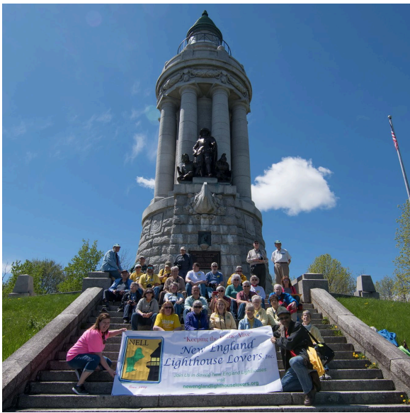
NELL trip group photo in May 2019 at Crown Point, NY