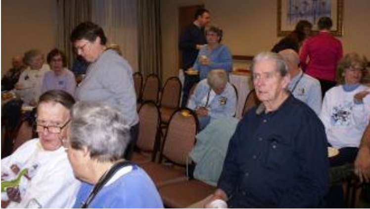
LHHC&Y meeting in January 2015