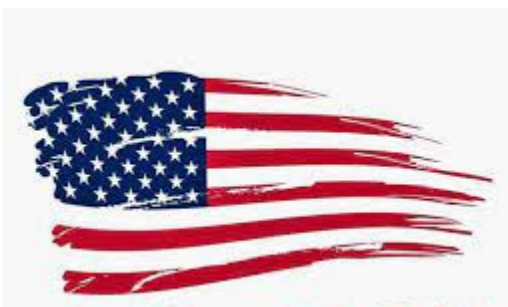
CELEBRATE FLAG DAY