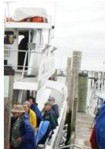
Getting off NELL Boat Trip June 2016