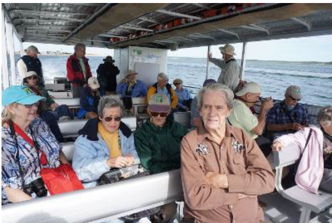
Boat trip out to Sandy Neck Lighthouse in September 2018