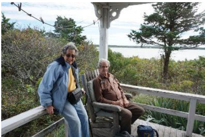
On porch at Sandy Neck 2018 & Group photo