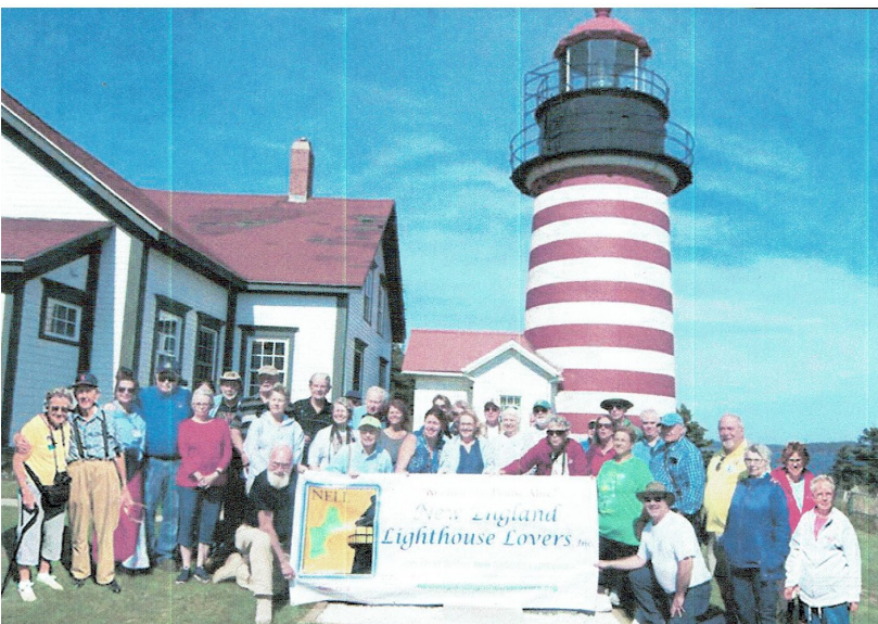
NELL group photo at West Quoddy Head on Sept. 22, 2019 Last time Carbones able to attend NELL event.