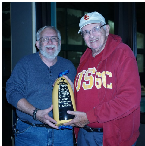
NEW 2025 Mr. & Ms. NELL