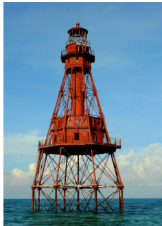
AMERICAN SHOAL LIGHTHOUSE FLORIDA KEYS THIS LIGHTHOUSE WAS BUILT WITH THE SAME DESIGN AS FOWEY ROCKS LIGHTHOUSE LOCATED IN THE UPPER MOST KEYS. (THERE WERE SLIGHT DIFFERENCES