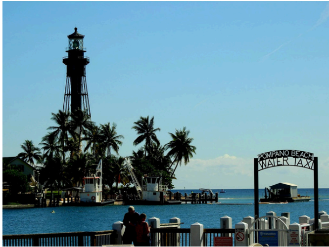
HILLSBORO INLET LIGHTHOUSE FLORIDA THE 2ND ORDER FRESNEL IS A BIVALVE LENS AND IS NINE FEET ACROSS.