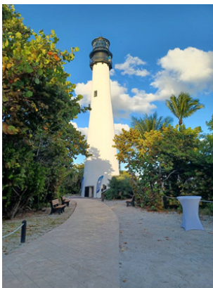
CAPE FLORIDA LIGHTHOUSE KEY BISCAIYNE, FLORIDA.